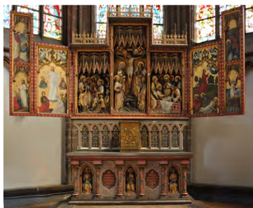
13 Altarpiece with panels showing scenes from St James the Major

To contact "Les Amis de l'église Saint-Jacques de Tournai": info@saint-jacques-tournai.be